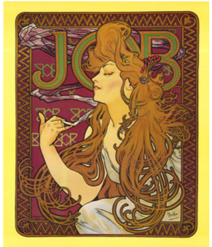
Poster by Alphonse Mucha