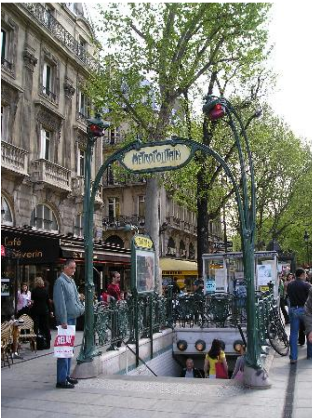
Metalwork subway entrance, Paris