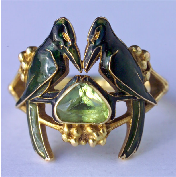
Gold, enamel and peridot ring by Rene Lalique 1904